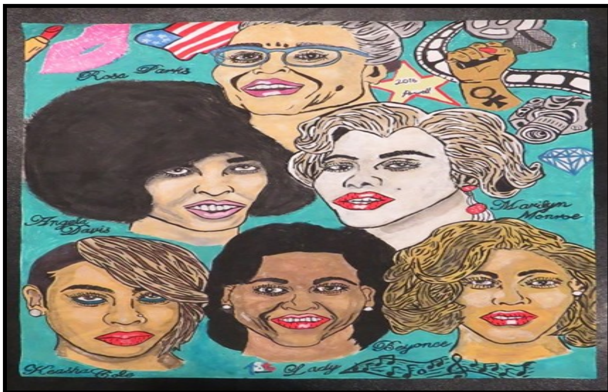
Drawing by Resident Powell